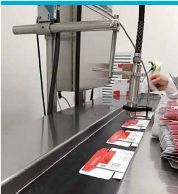
Legrand has modified its processes and best practices to include using GS1 unique identifiers and other valuable information encoded in the GS1 DataMatrix barcode on each dosage of Omeprazol.

One of the challenges during implementation was establishing automated systems to facilitate the control, traceability and safety of the drug preparation process. Higuera advises, “Many of the information systems are in the design and preparation phase, to achieve proper registration, control, labeling, dispensing and administration of the pharmaceutical service. We know that this takes time but is finally a process, which will improve over time.”