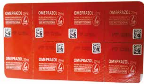
Hospitals can now scan to read each GS1 DataMatrix barcode, helping to ensure that the right medicine is being dispensed to the right patient.